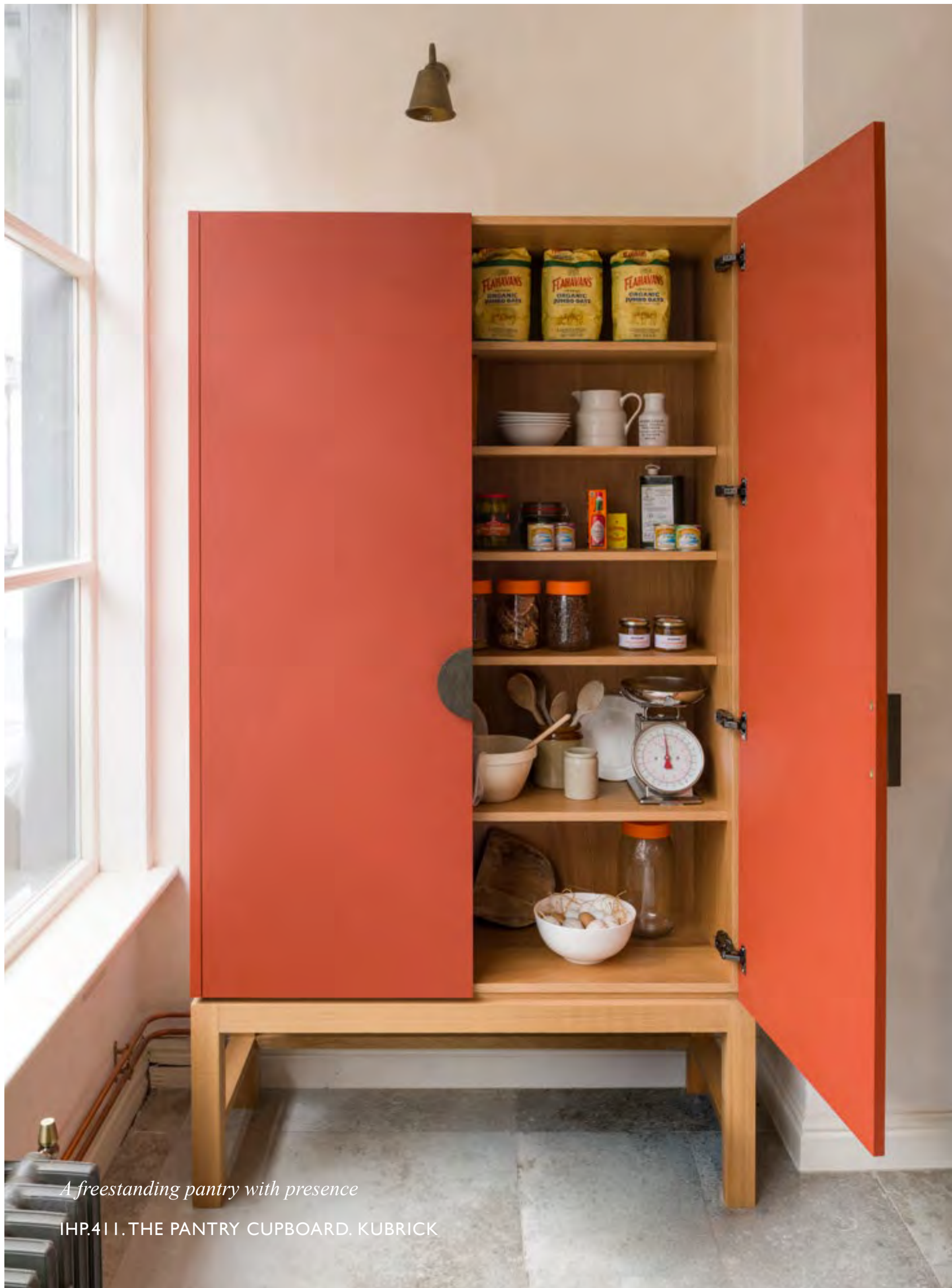
A freestanding pantry with presence