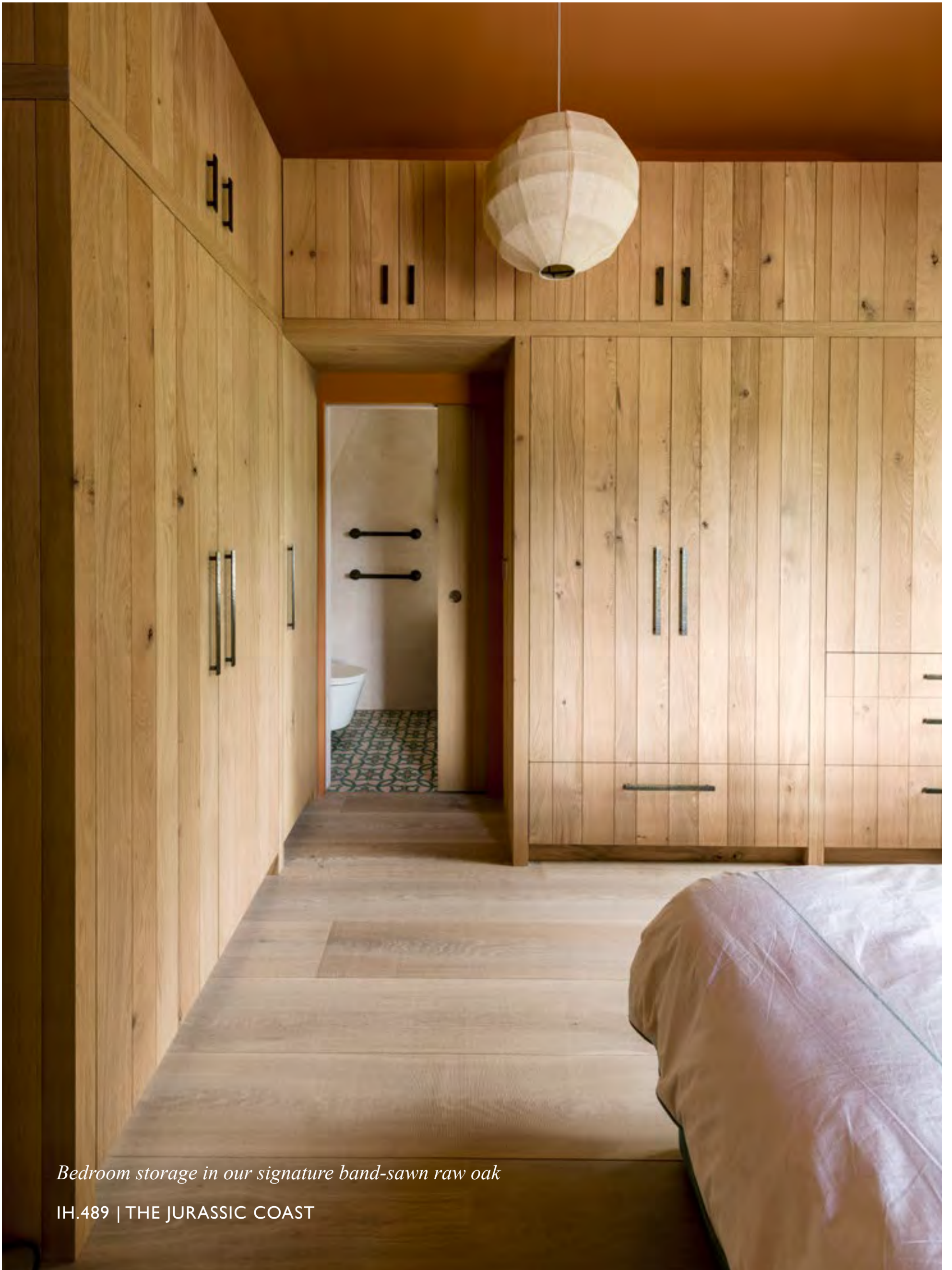
Bedroom storage in our signature band-sawn raw oak