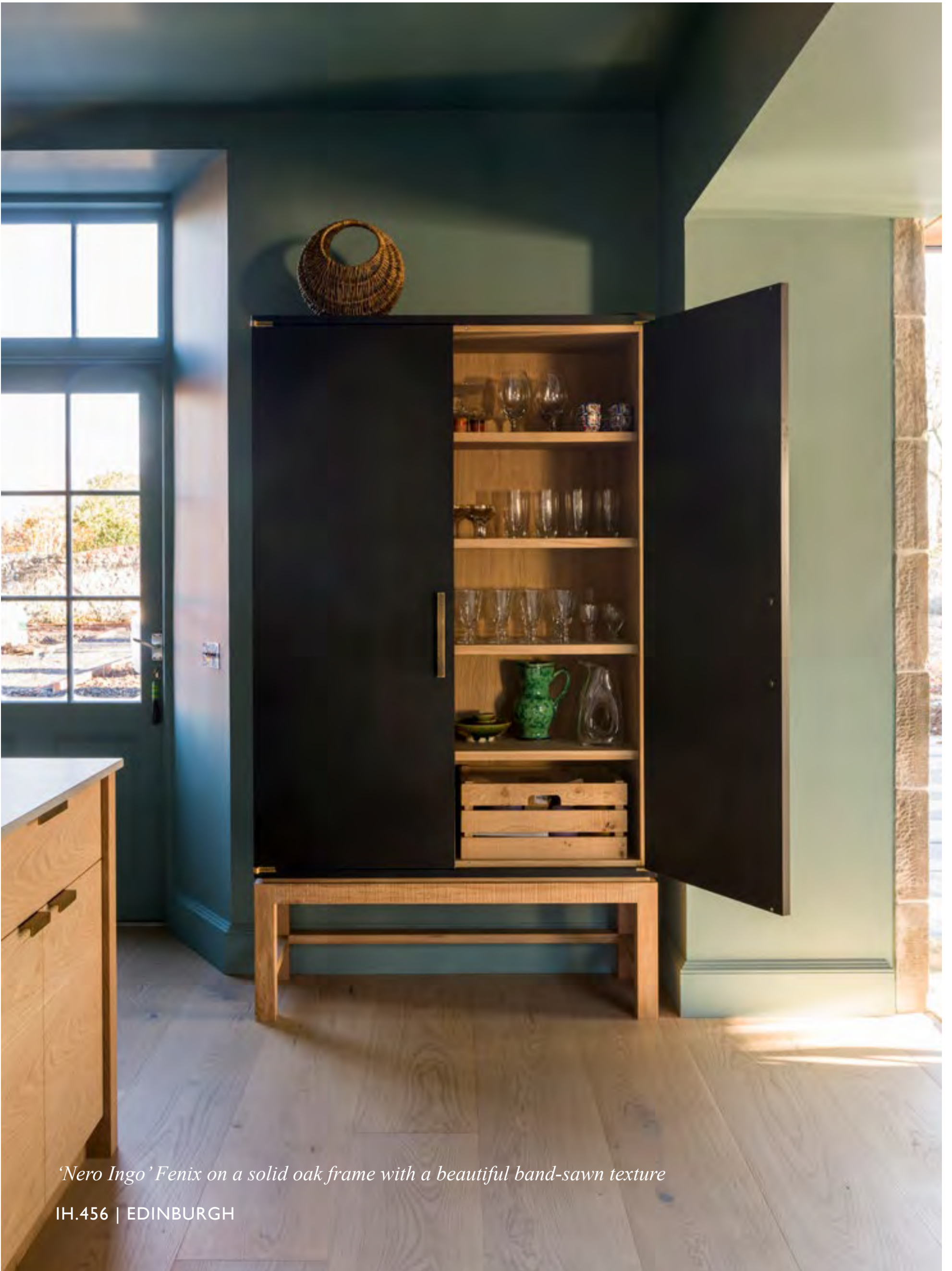
'Nero Ingo' Fenix on a solid oak frame with a beautiful band-sawn texture