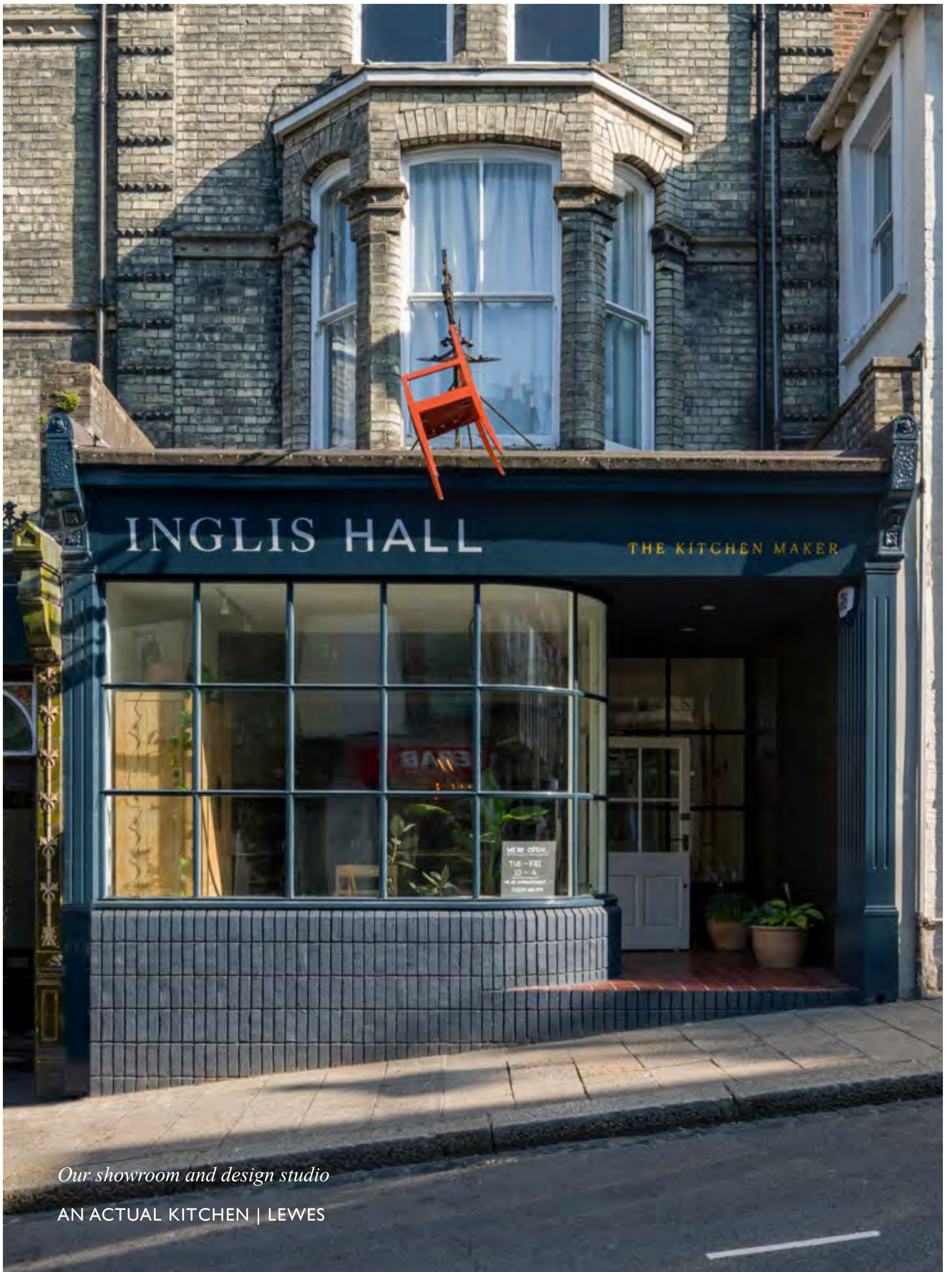
Our showroom and design studio AN ACTUAL KITCHEN | LEWES