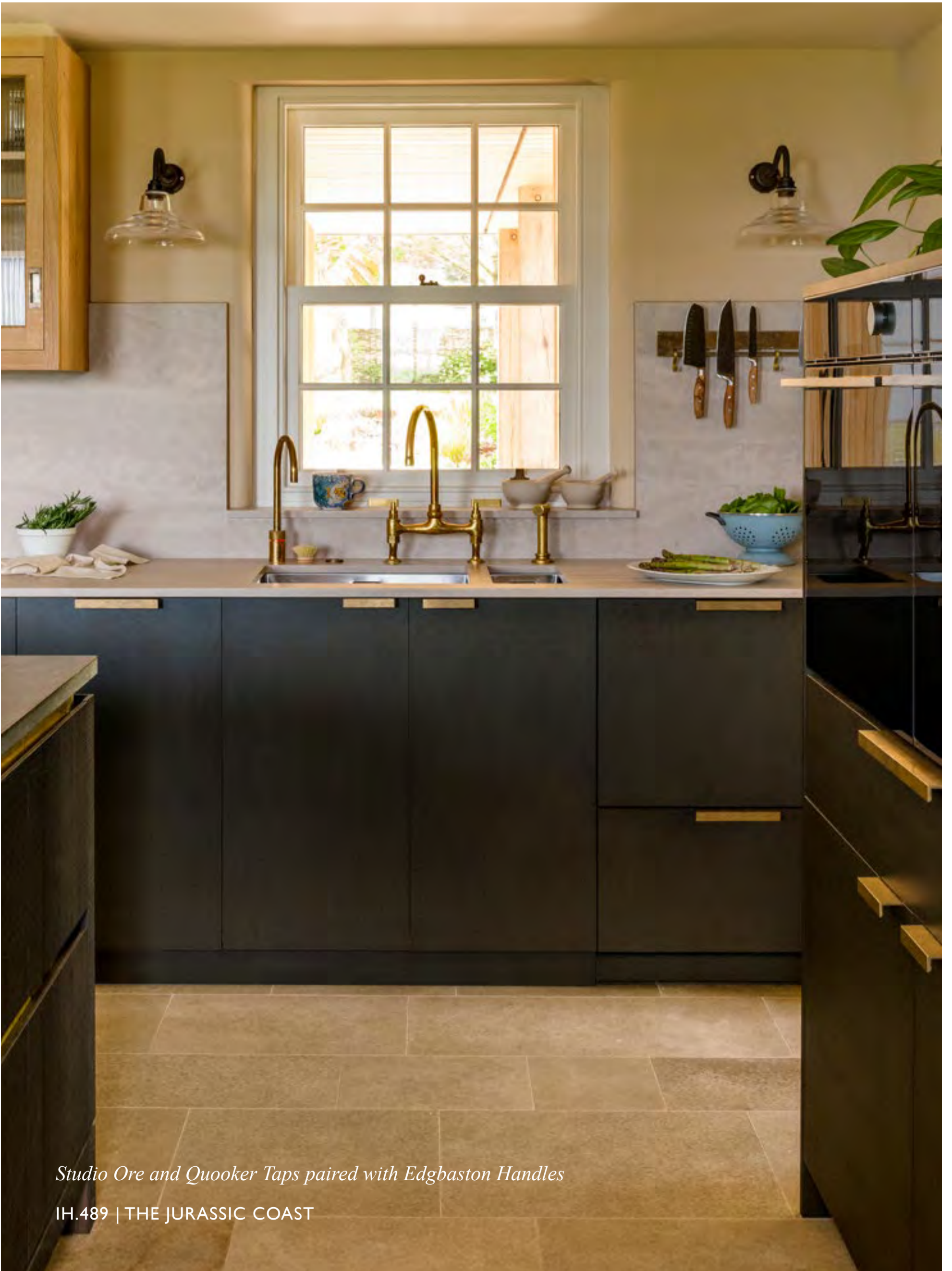
Studio Ore and Quooker Taps paired with Edgbaston Handles