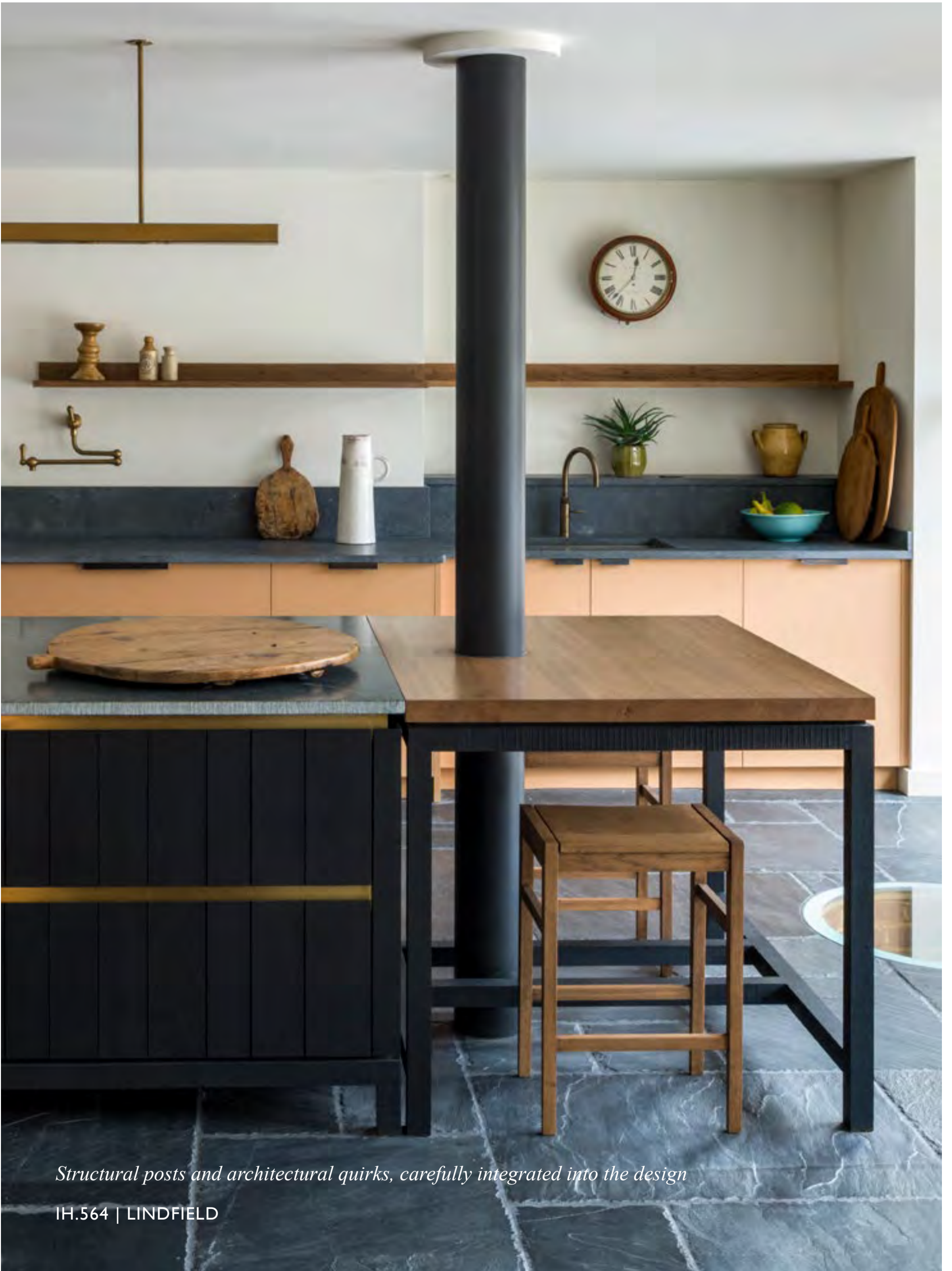
Structural posts and architectural quirks, carefully integrated into the design