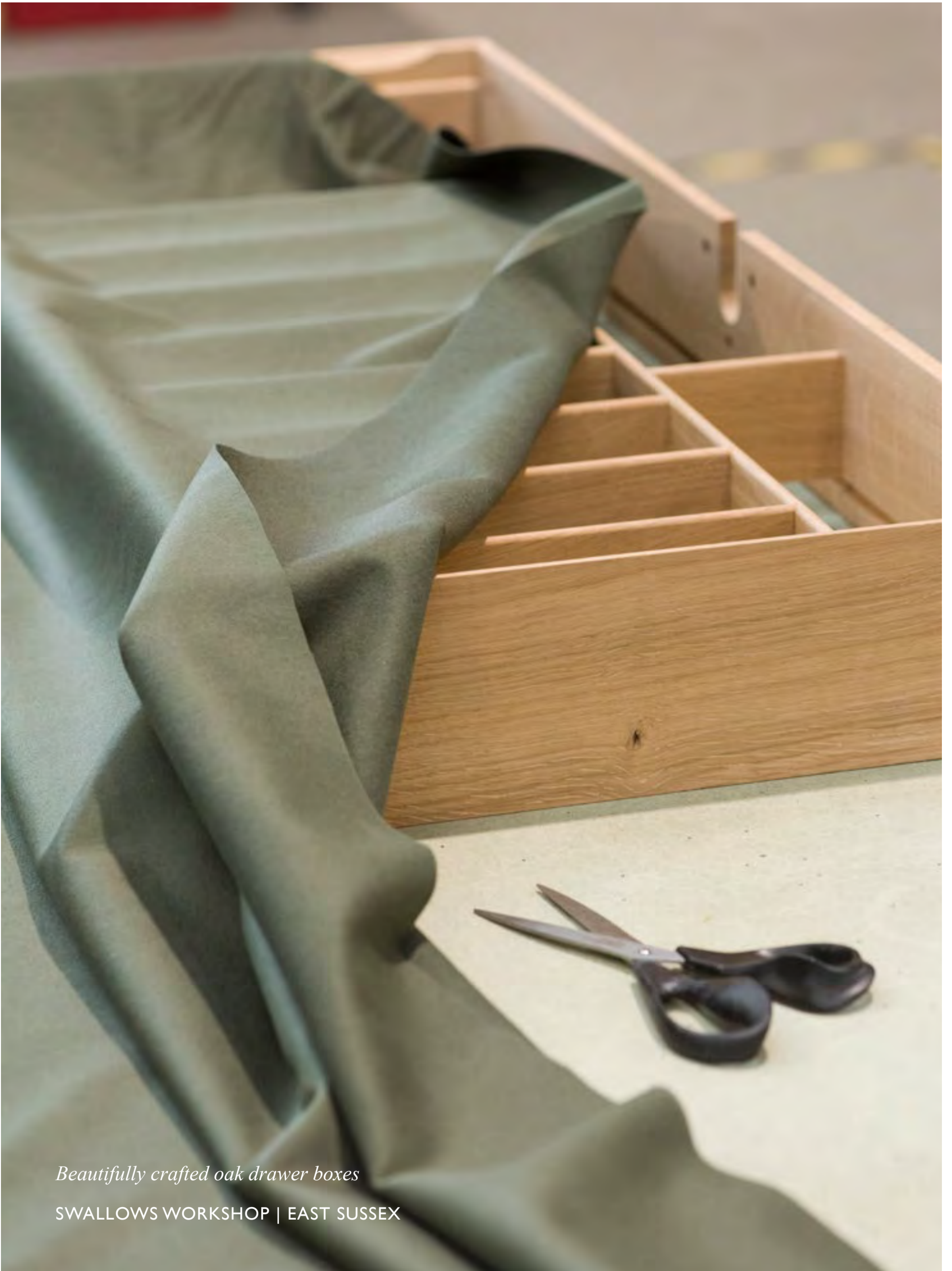
Beautifully crafted oak drawer boxes