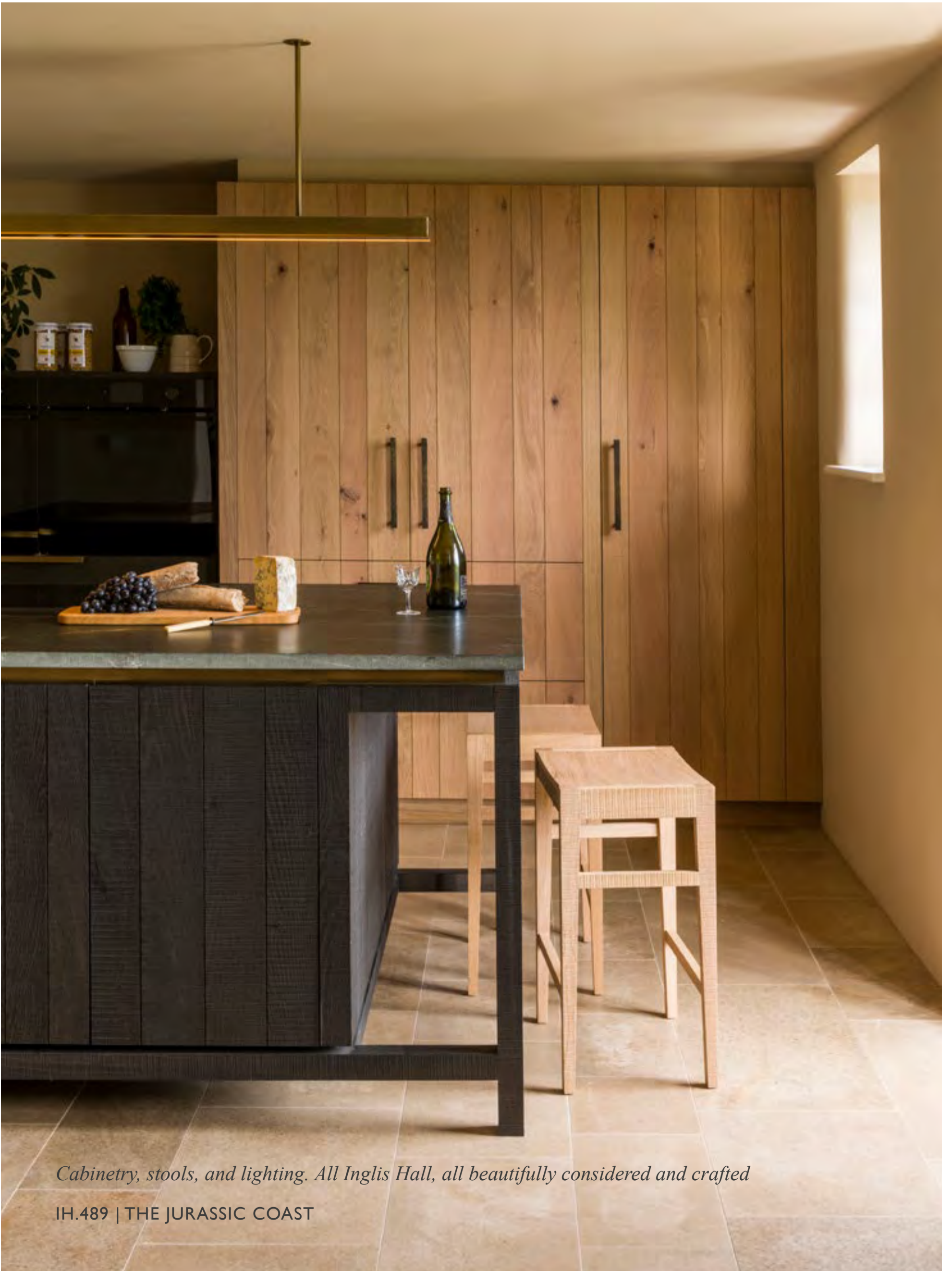
Cabinetry, stools, and lighting. All Inglis Hall, all beautifully considered and crafted