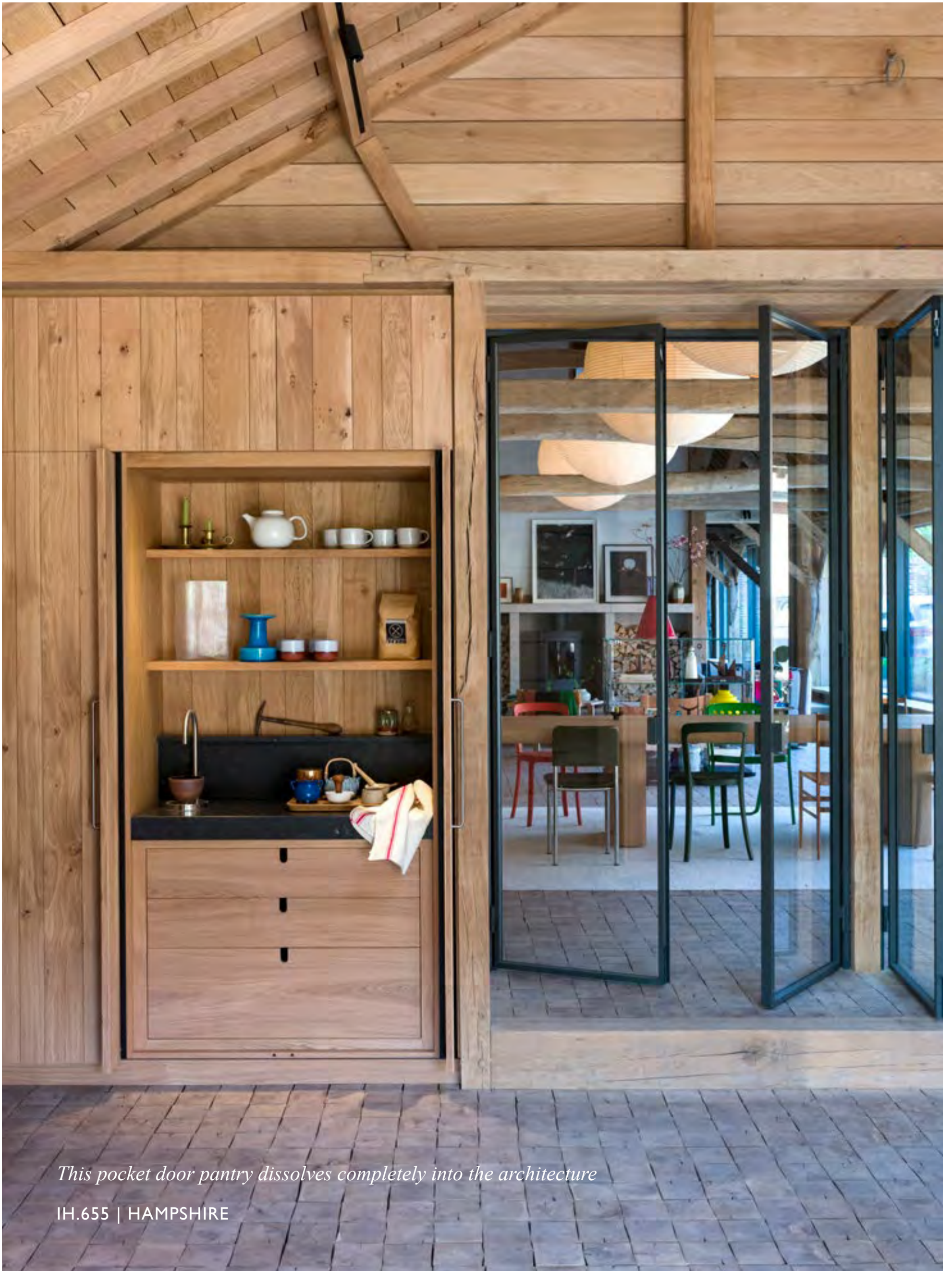
This pocket door pantry dissolves completely into the architecture