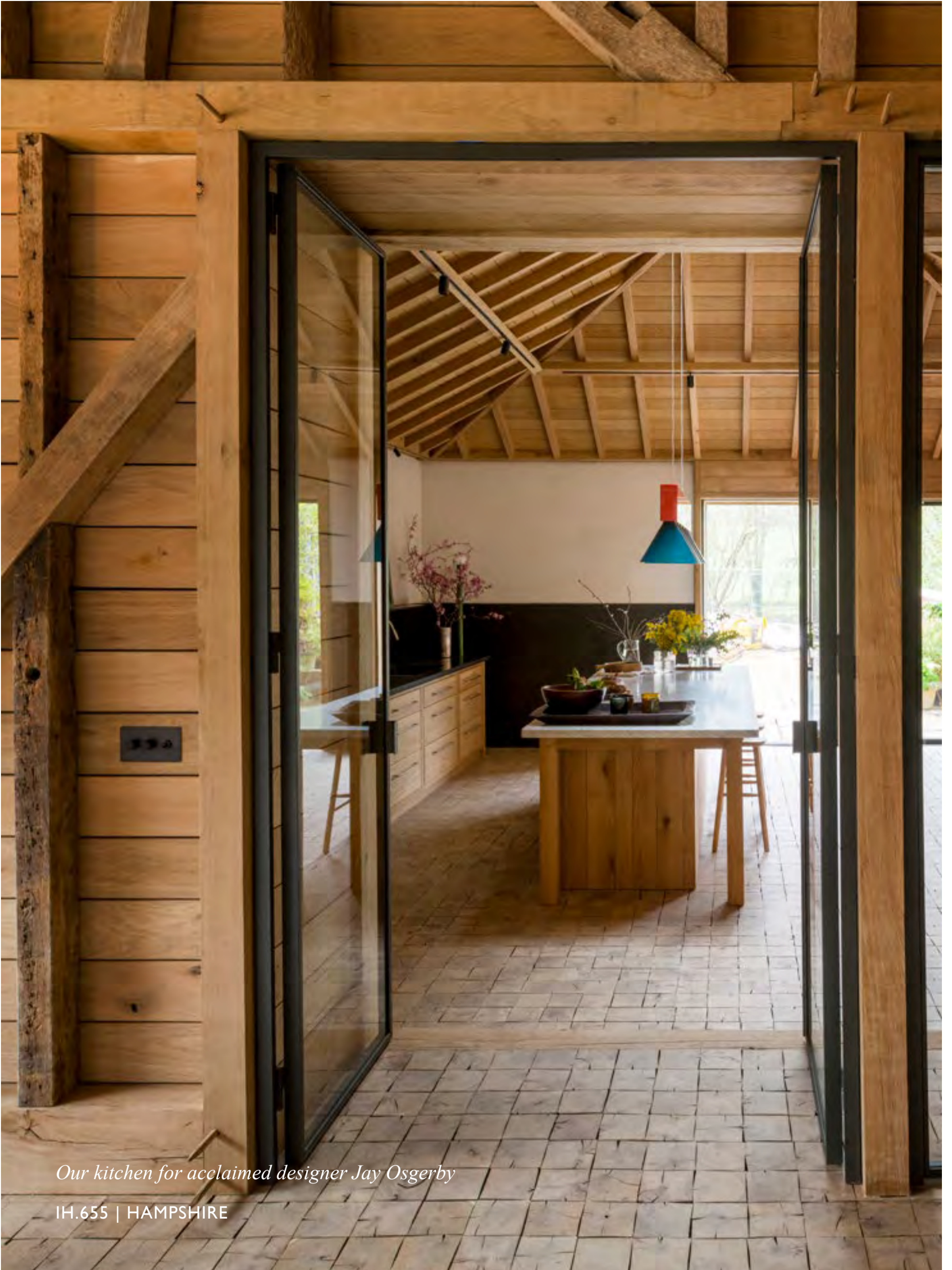
Our kitchen for acclaimed designer Jay Osgerby