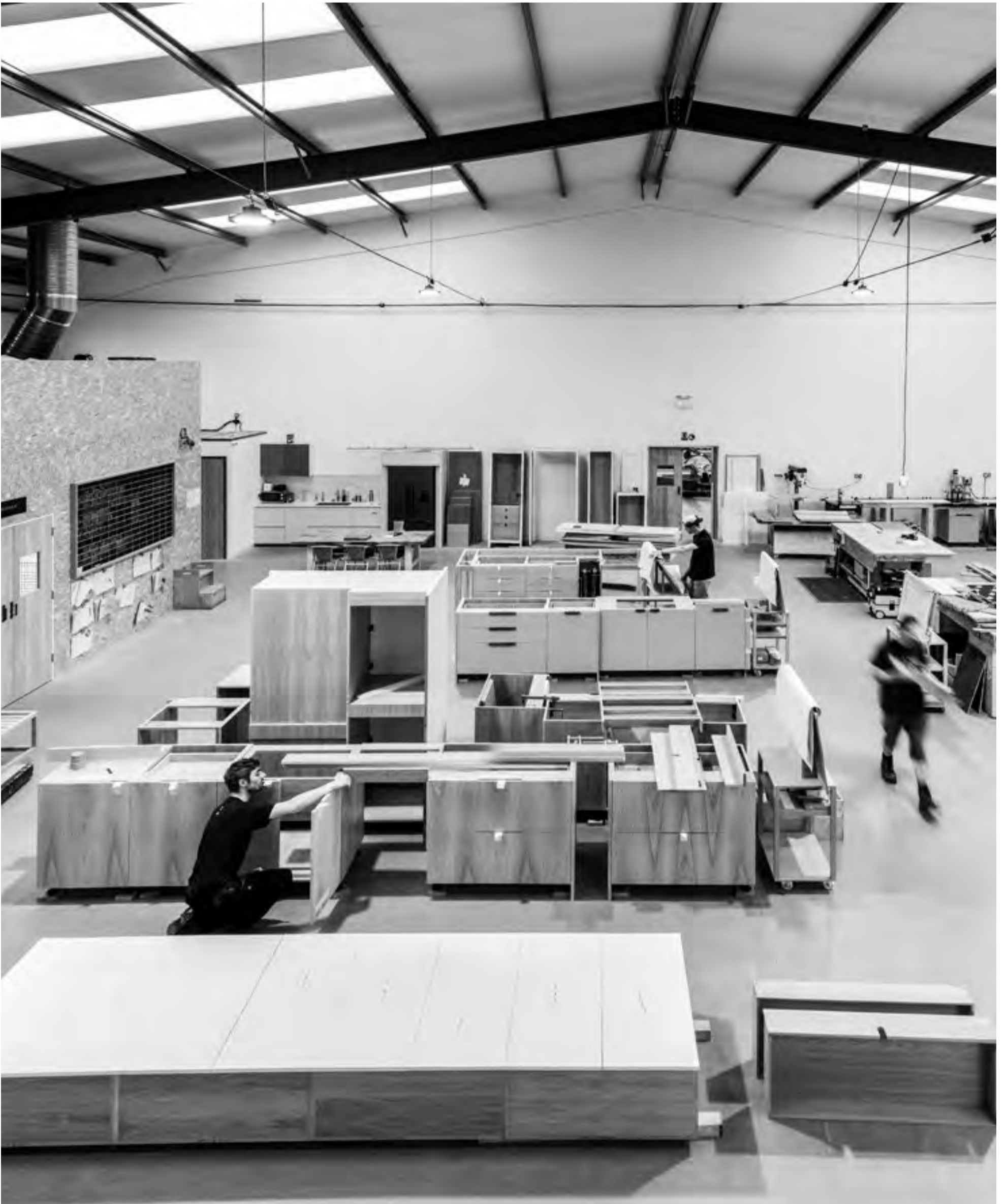
You hear it before you see it. The low thrum of machines, the soft rasp of tools against wood SWALLOWS WORKSHOP | EAST SUSSEX