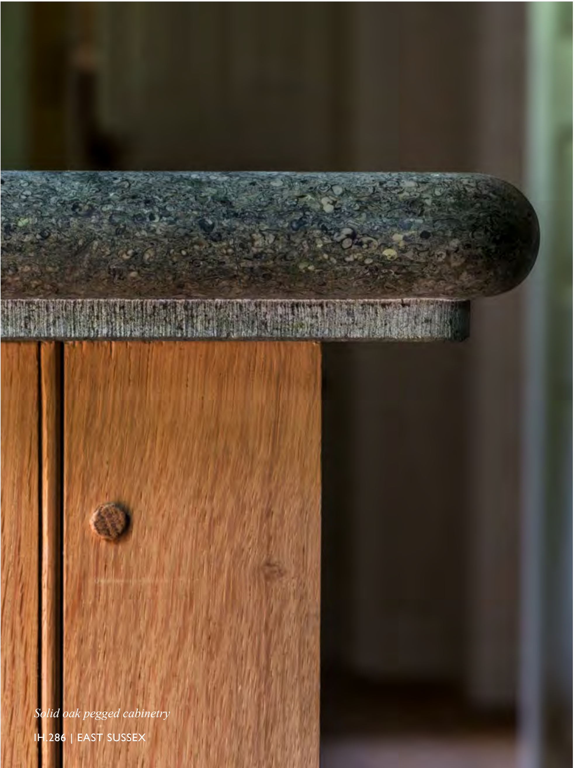
Solid oak pegged cabinetry