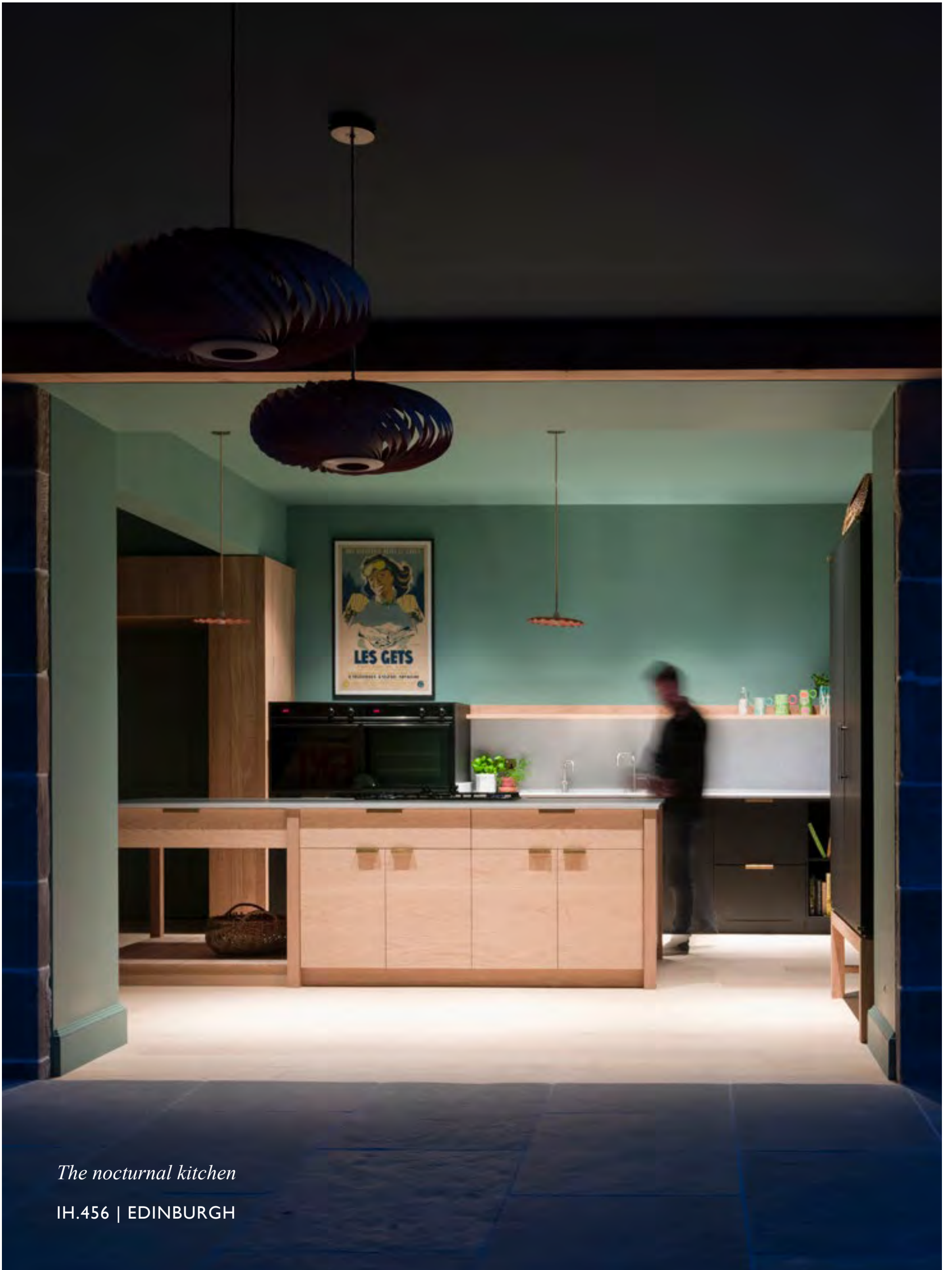
The nocturnal kitchen