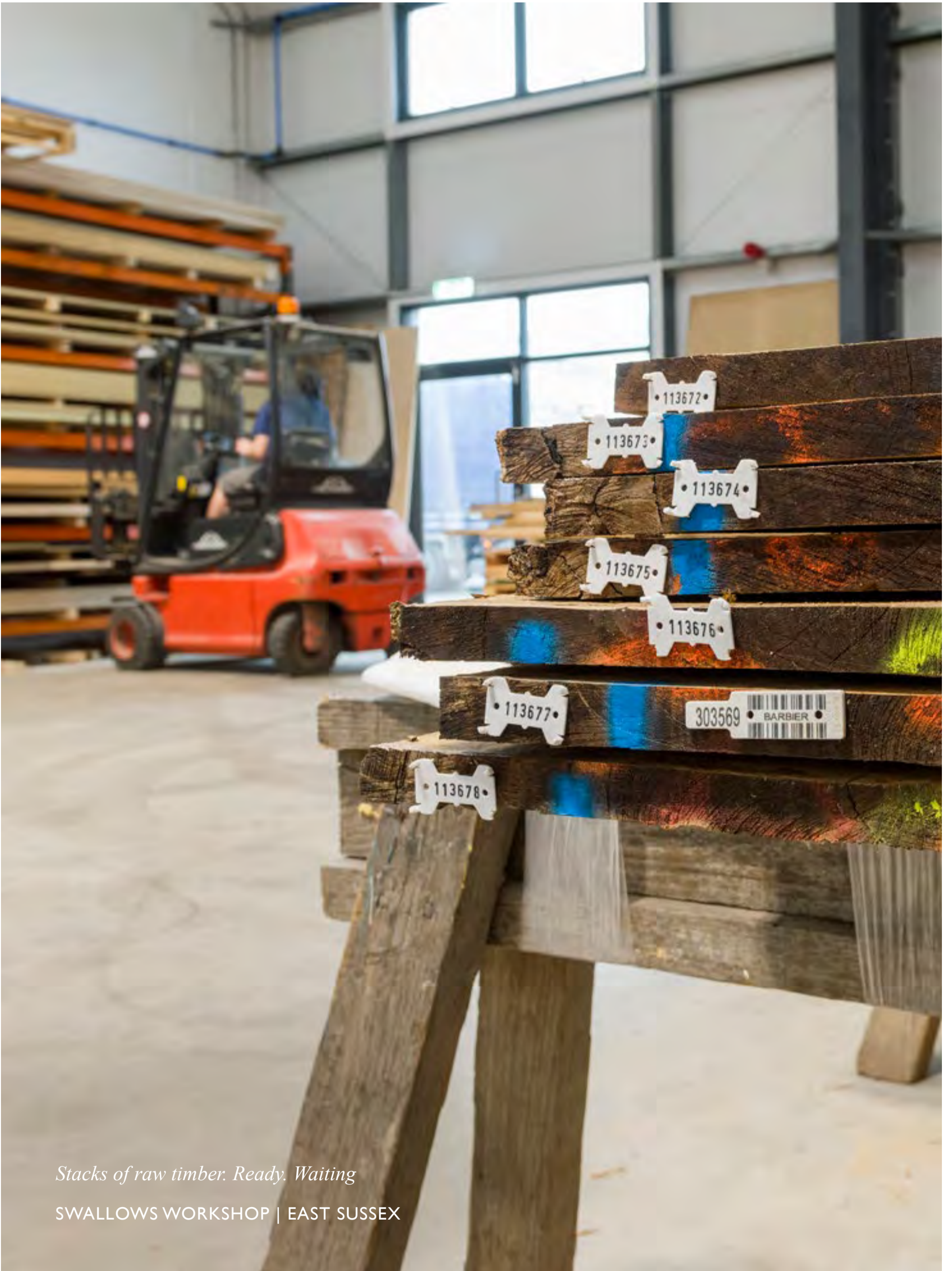
Stacks of raw timber. Ready. Waiting SWALLOWS WORKSHOP | EAST SUSSEX