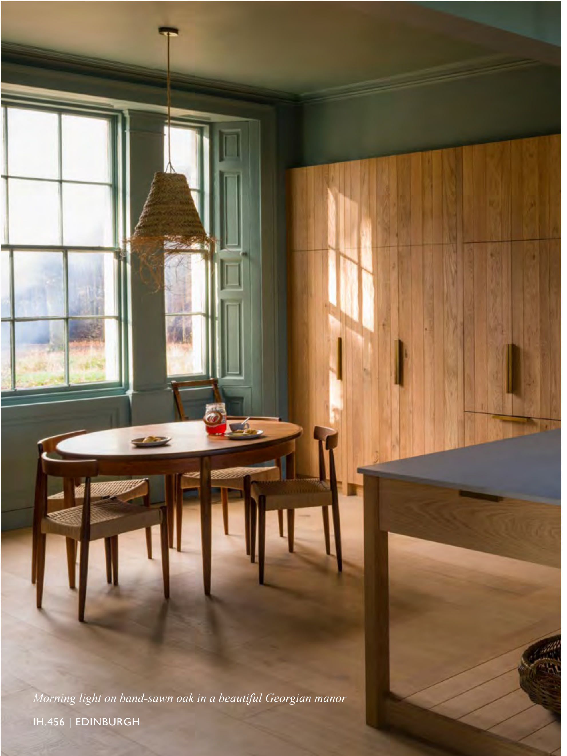
Morning light on band-sawn oak in a beautiful Georgian manor