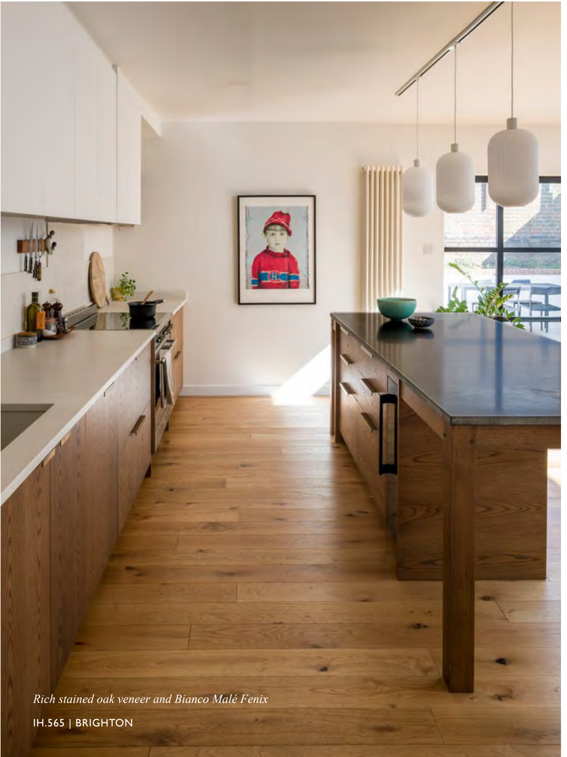
Rich stained oak veneer and Bianco Malé Fenix