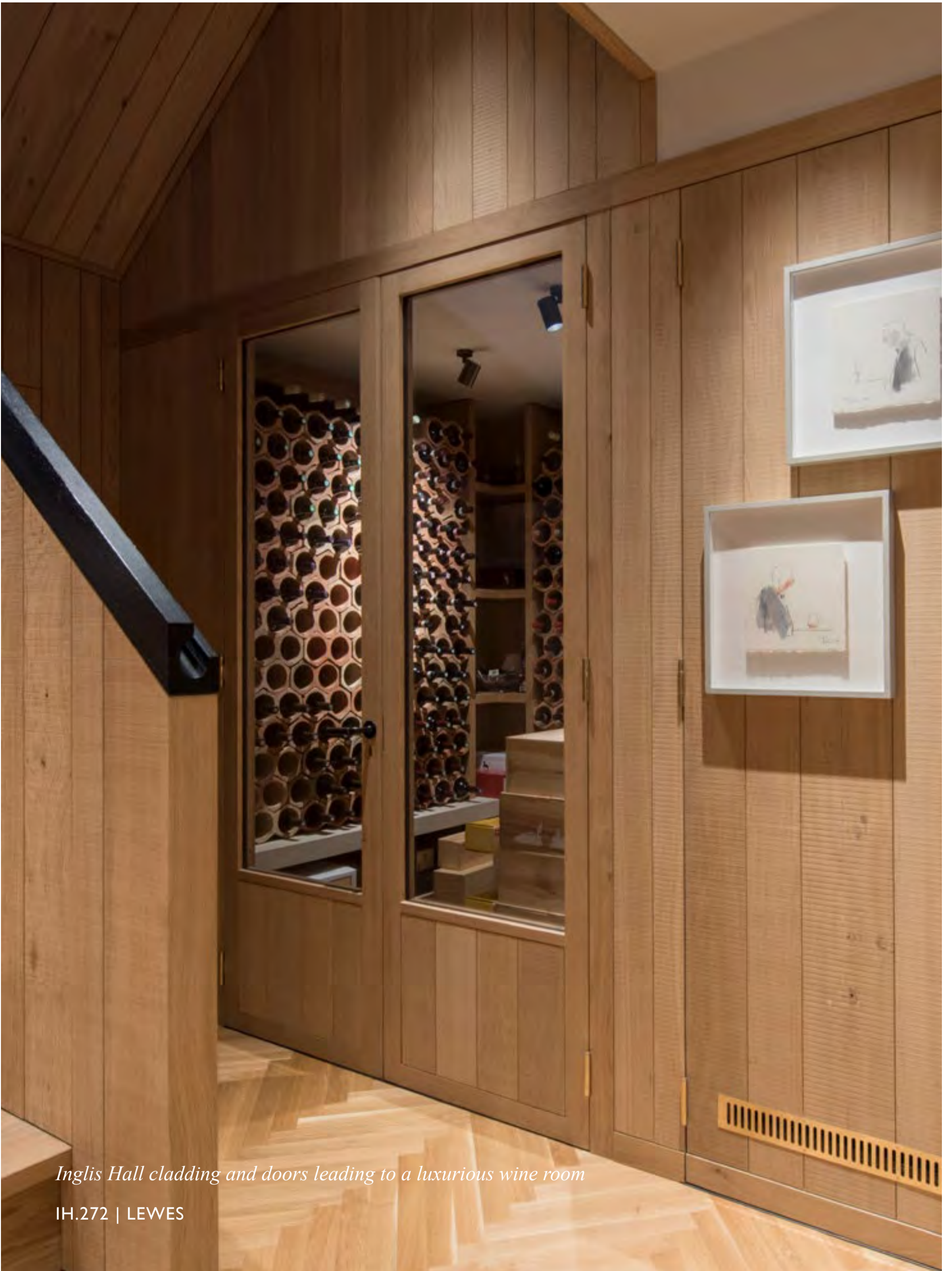
Inglis Hall cladding and doors leading to a luxurious wine room