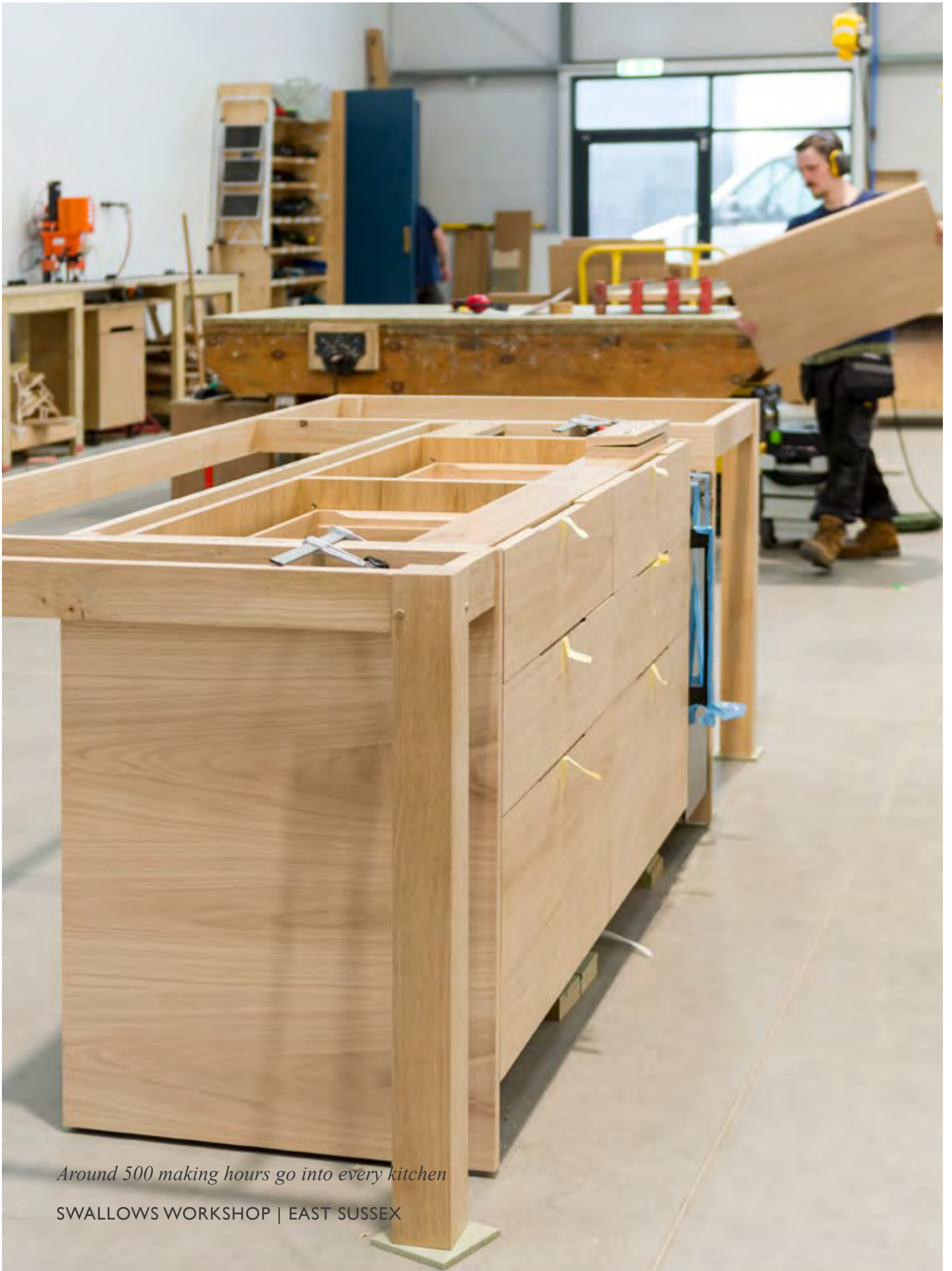
Around 500 making hours go into every kitchen SWALLOWS WORKSHOP | EAST SUSSEX