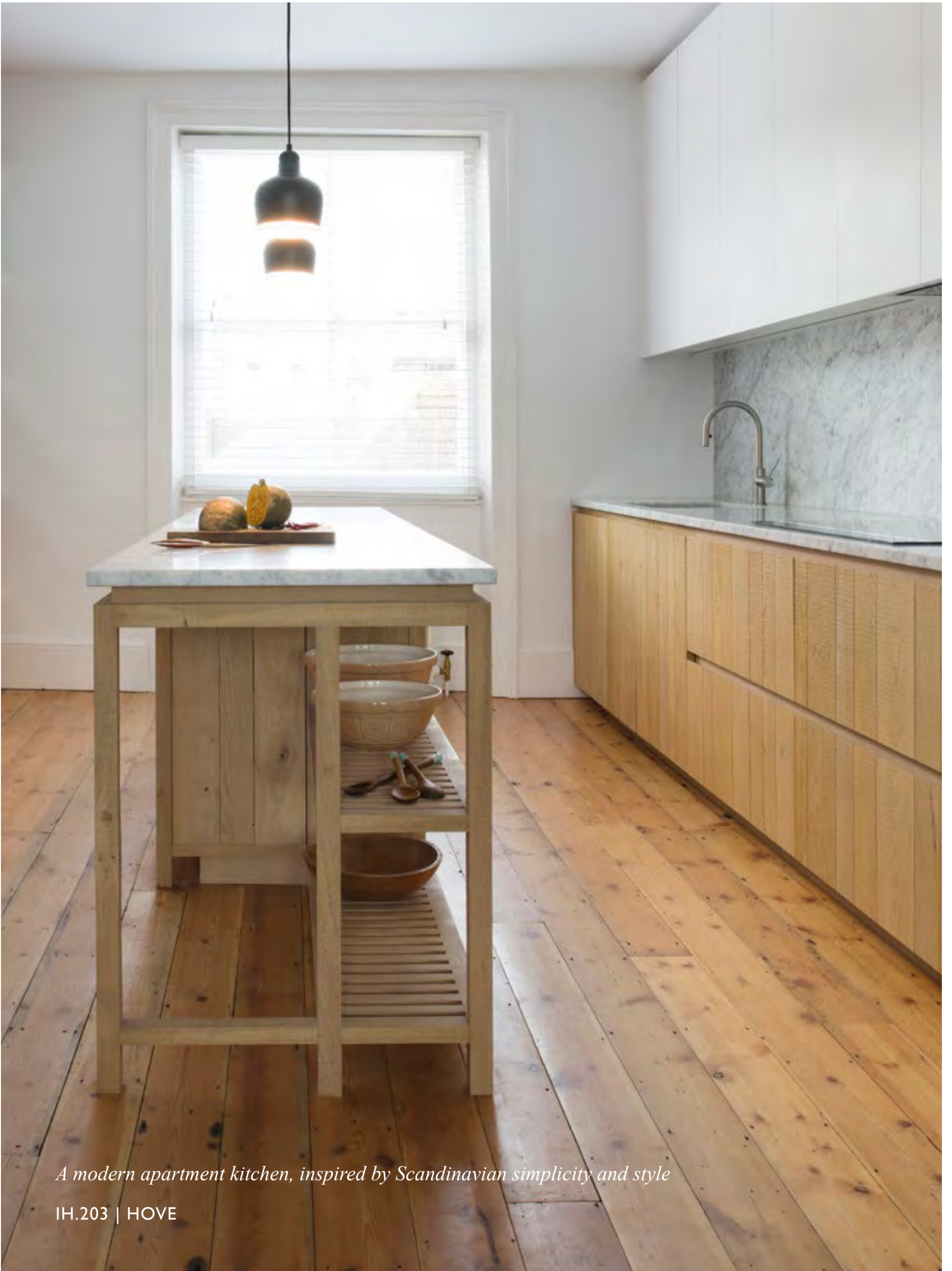
A modern apartment kitchen, inspired by Scandinavian simplicity and style