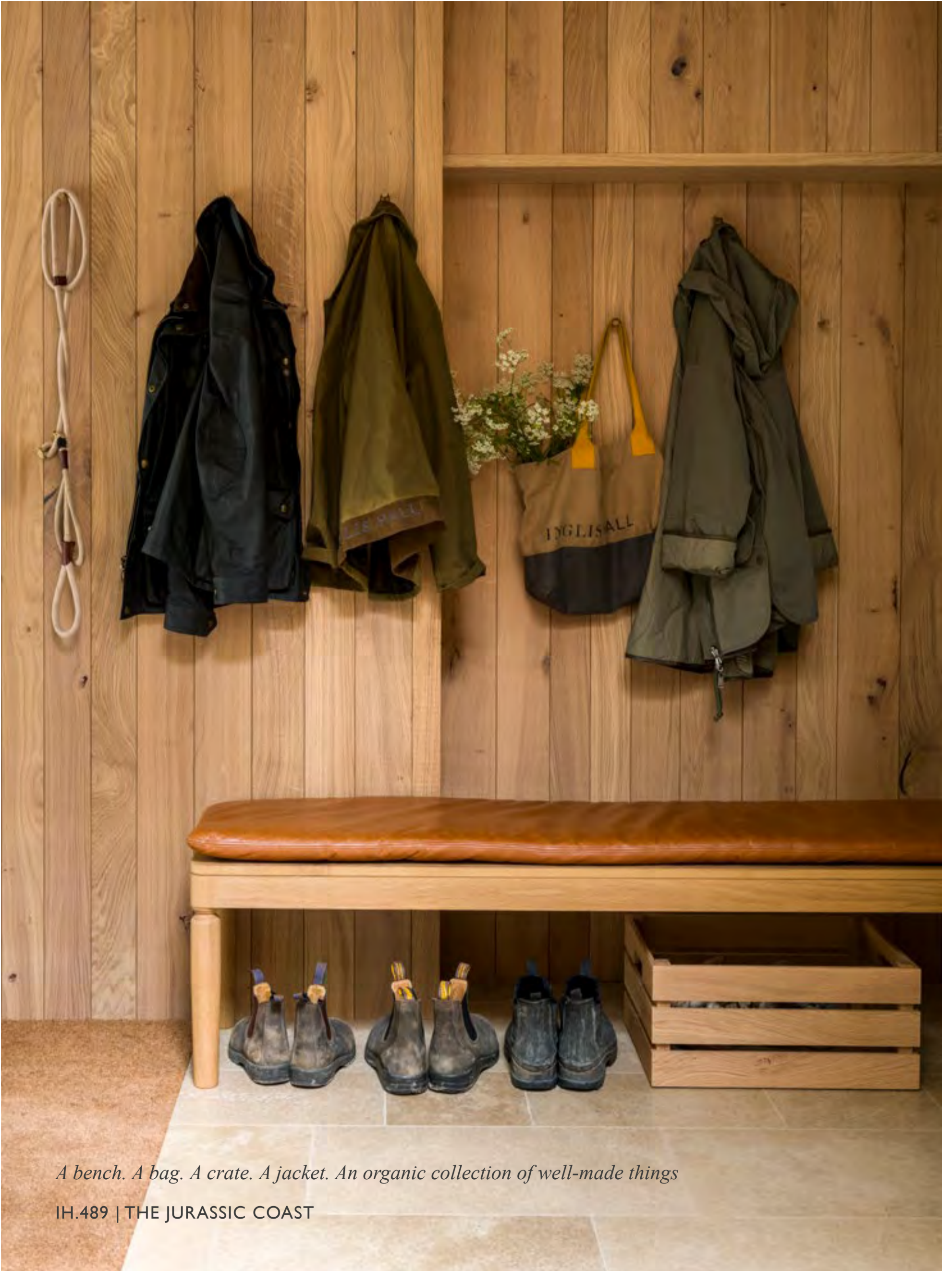
A bench. A bag. A crate. A jacket. An organic collection of well-made things