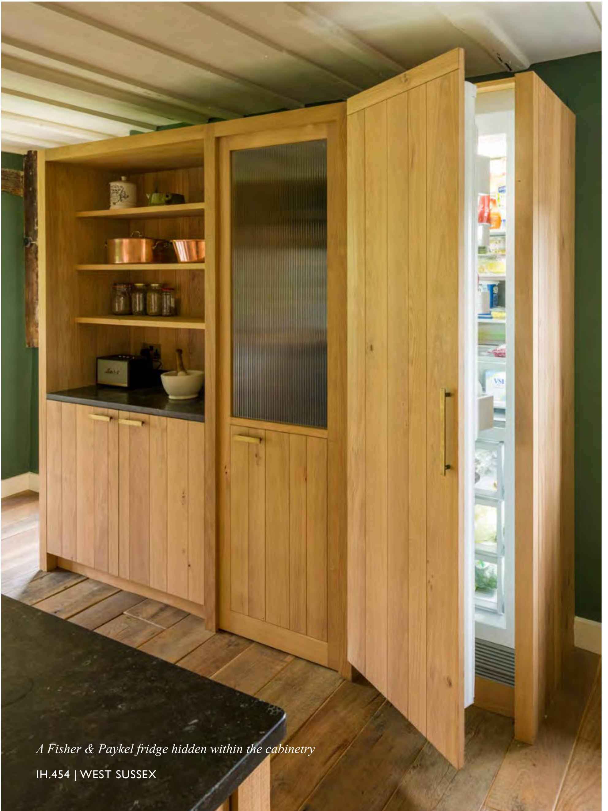
A Fisher & Paykel fridge hidden within the cabinetry